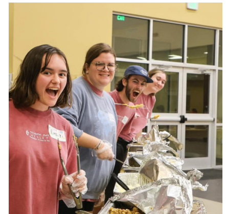
Students at FSU Wesley

Veteran campus ministry supporters may recognize this event as a revival of the beloved Garnet, Gold, and Blue Jean Banquet, which was faithfully hosted at 705 W. Jefferson St. for over a decade. The latest iterations of the event took on a more upscale aura, featuring catered banquets and distinguished speakers from Seminole Athletics. Now, six years since the last event, the ministry is in a new era, marked by dynamic growth and revival. Simultaneously, we are back to our roots with the return of the barbeque chicken dinner and blue jean attire. This year's event will feature student-led music, testimony, and a silent auction fundraiser. Make sure to visit fsuwesley.com to purchase your tickets in advance. If you'd like to support in a different way, we are looking for partners who are willing to donate an item for our silent auction. Auction partners may call 850-222-0251 or visit the event webpage for more information. As an alumnus of this ministry, I can personally attest to the fact that lives are changed here. The church is built here. It is an exciting thing to witness. Come and see!