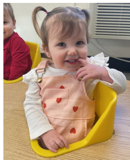
Even the toddlers showed their Valentine spirit!