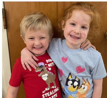
Good friends shared smiles together!