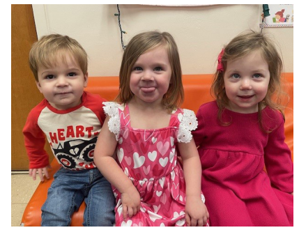
There is always time to be silly!