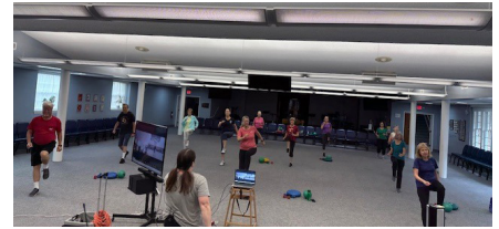
Two views of the BFC Variety Mix Class