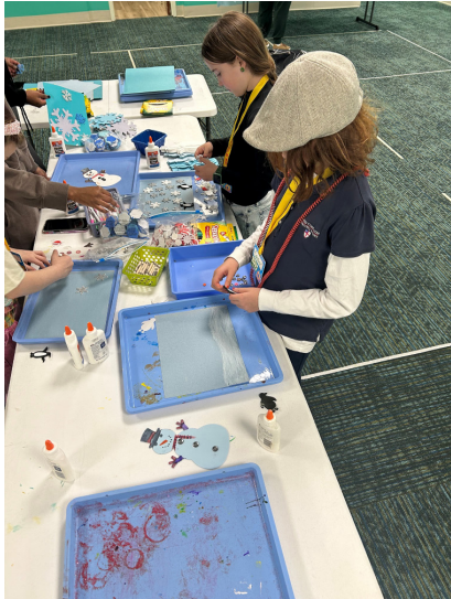
NETKids having fun while learning to love Jesus and others

Trinity's kids have been busy as our Children's Ministry continues to grow in God's love! NETKIDS is in full swing each Wednesday night! Woodworking, cooking, and crafting—Enjoy these snapshots of joy in action!