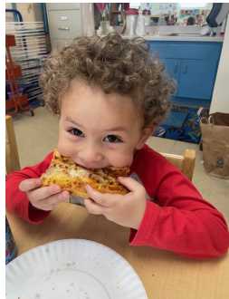
Pizza for lunch is always fun at preschool!