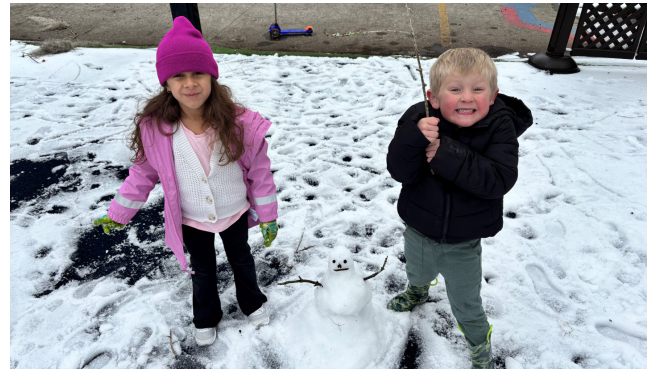
Snow Day on the playground with friends