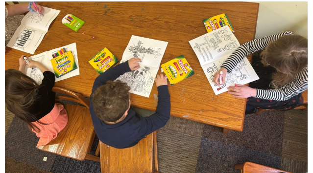
Coloring in our Bicentennial Coloring Books