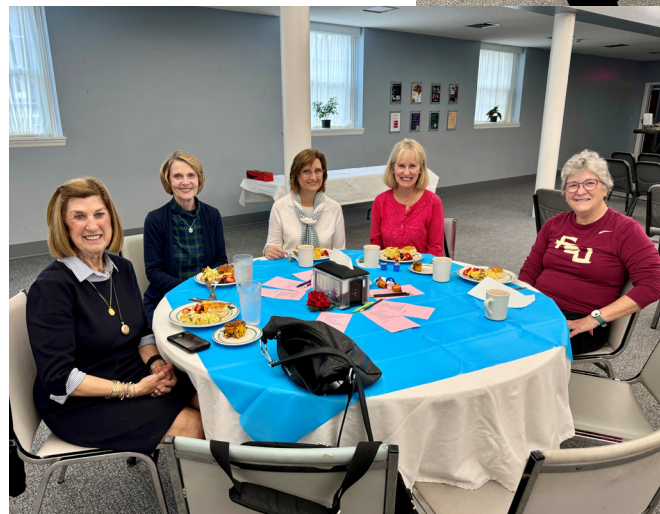
Adult Brunch on March 4, 2024