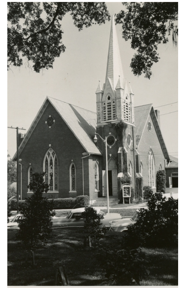
Trinity UMC in 1893

The congregation moved into the new church owing $1,500 to the pastor and $1,000 to the Board of Church Extension. Both amounts were quickly repaid, and the church moved on to new activities to proclaim the glory of God.