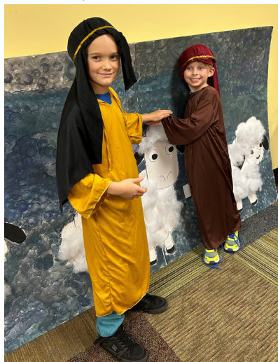
Trinity's youngest shepherds prepare for their role in "Journey Through Bethlehem" on Wednesday, December 13th.

The Children's Ministry is a fabulous place for kids to be themselves, build lasting friendships and grow closer to God. Please join us!