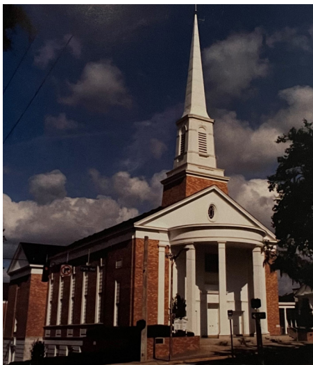
Trinity United Methodist Church Tallahassee's First Church 1824 - 1999