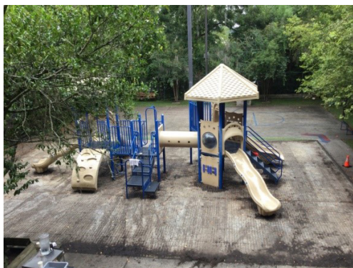
Demolition finished- playground is prepped and ready for the professionals