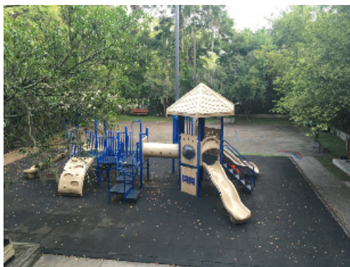
2022 BEFORE the demolition. All of the color had long ago faded, and the tiles had melted and warped showing years of sun damage.