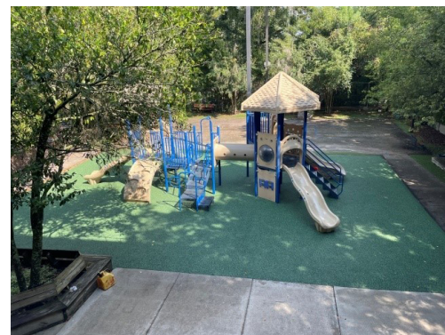
Here is the finished product!