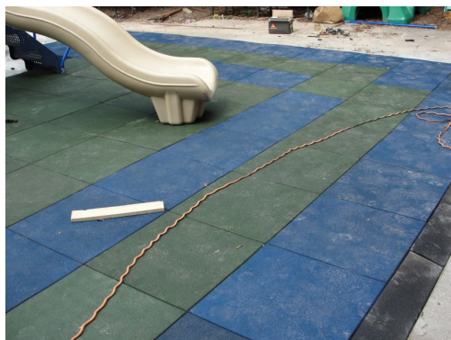
The playground during the 2009 renovation